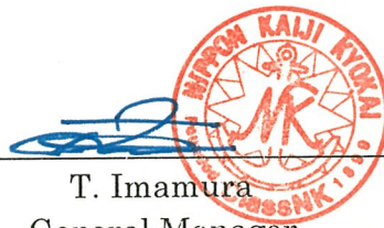
T. Imamura General Manager

This Certificate will remain in force until 9 December 2015. Issued at Tokyo on 10 December 2014